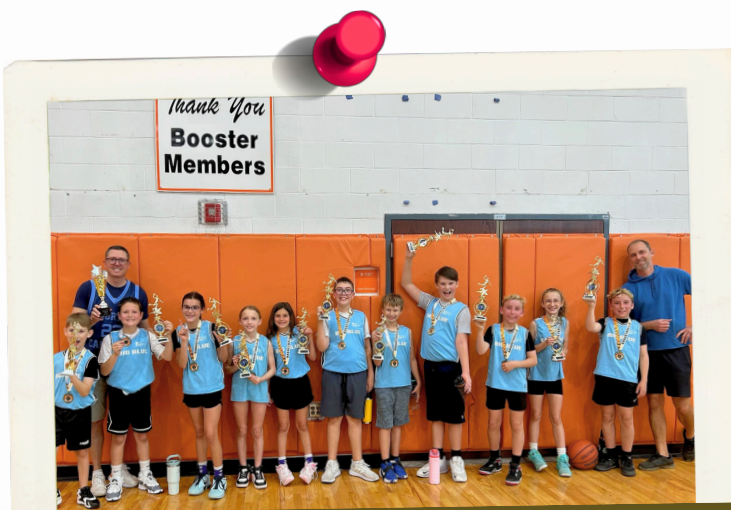
Junior Division Big Blue