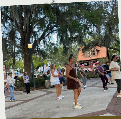
Line Dancing at Sunset Park

Our line dancing participants took to Sunset Park and showed off their moves, bringing great energy to Historic Downtown. Want to give it a try? Check out the Aquatics and Wellness schedule.