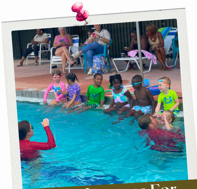
Swim Lessons For All Ages

The winter basketball season wrapped up with a great turnout! The season ran from mid-February through April and welcomed over 177 participants. Thank you to everyone who came out to support, including our fans, staff, and especially our volunteer coaches who helped make the season a success.