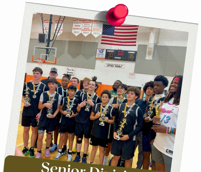
Senior Division Heat

The winter basketball season wrapped up with a great turnout! The season ran from mid-February through April and welcomed over 177 participants. Thank you to everyone who came out to support, including our fans, staff, and especially our volunteer coaches who helped make the season a success.