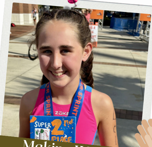
Making Waves Beyond the Pool