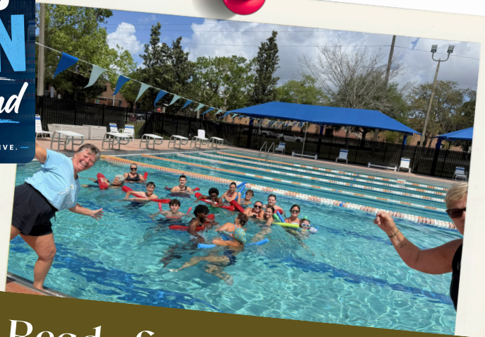
Ready for Swim Season